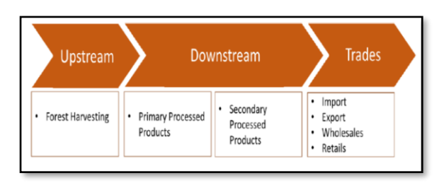
Figure 2: The Value Chain of Timber Industry in Malaysia

Table 3 below reports the trend of production for five main wood-based products from 2017 until 2021.